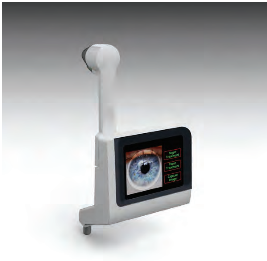
The Slit lamp-mountable C-Eye device that delivers a precise amount of UV-A radiation in an automated manner. It also comes with an integrated safety mechanism by measuring the chromophore's fluorescence in real time (patent pending).