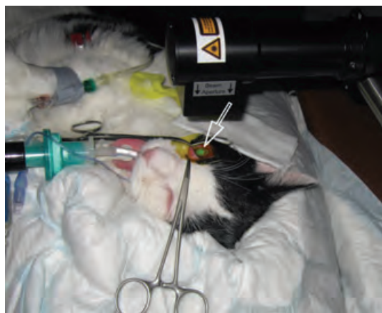
Figure 1. Clinical setup of the CXL procedure under general anesthesia. The irradiation source is placed at a distance of approximately 5 cm to the eye. The cornea is soaked with riboflavin that shows fluorescence when irradiated at 365 nm (arrow).

Based on the subjective evaluation of stromal stability/melting activity as described in the Materials and Methods section (including the presence of cellular infiltrates, the perceived stability of the stroma via tactile assessment with a cotton-tipped applicator, the presence of changes in corneal contour and ulcer depth, and the presence of malacic corneal material in the ulcer area), the stroma was judged to be stable between 1–20 days post-CXL in all patients. A stable stroma was observed much earlier in four of six cases: between 1–2 days after CXL in three cases (Cat1, Dog1, and Dog2) and in 4 days in another case (Cat2). CXL as well as the post-treatment period was uneventful in Cat1, Cat2 (Fig. 2 a–d) and Dog1, and the clinical signs of corneal melting were markedly reduced immediately after CXL (see Table 1). In Dog2 (pug, Fig. 3 d–f), in which keratomalacia affected the superficial stroma of the entire central and mid-peripheral cornea, the stroma was judged to be stable on the first day after CXL. However, this patient did develop significant superficial pigmentation during the second month after the procedure. The treated cornea of cat number 3 (Fig. 3 a–c) developed a corneal sequestrum within the early post-treatment period and showed spontaneous extrusion within 1 month of development. From day 6 on, the stromal instability was confined