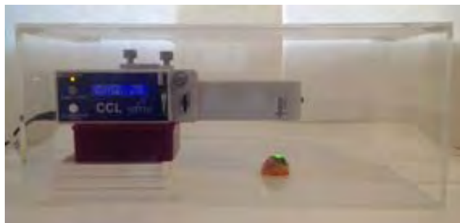
Figure 1. Experimental setup for the low-oxygen/helium environment. CXL is performed in a sealed chamber in a helium environment.

effect as long as the total energy is the same. In other words, treatment at 3 \text{ mW/cm}^2 for 30 minutes is equivalent to 9 \text{ mW/cm}^2 for 10 minutes. Commercial devices now offer ultrafast settings such as 18 \text{ mW/cm}^2 for 5 minutes and even 43 \text{ mW/cm}^2 for 2 minutes. While shorter treatment times are certainly attractive to clinicians and possibly their patients, commercial development has outpaced the scientific underpinnings that would support such a trend. Clinical validation in the form of peer-reviewed results is still missing despite most irradiation systems including high-fluence settings.